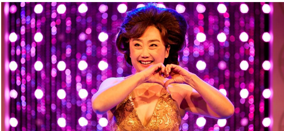
Miss Peony, 2023.