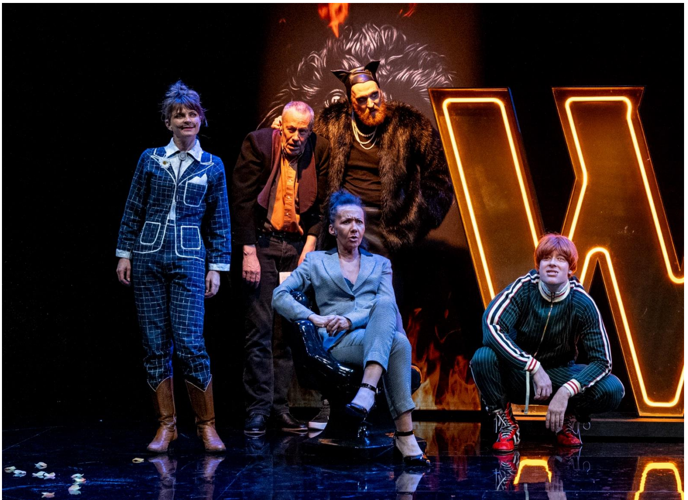
The Master and Margarita, 2023.