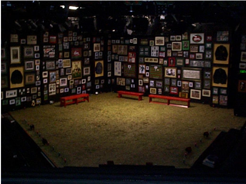
(set design: Brian Thomson)