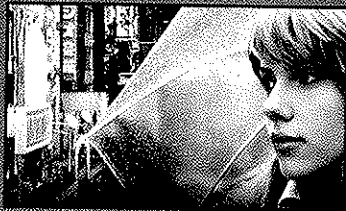
LOST IN TRANSLATION a new film by Sofia Coppola