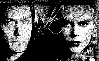
COLD MOUNTAIN a new film by Anthony Minghella

Enquire at the box office about the PALACE MOVIE CLUB - $9.50 tax every day, all day