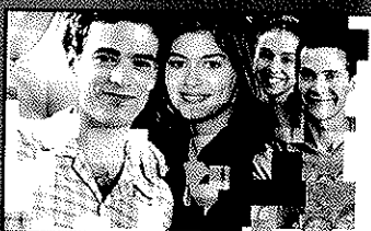
THE SPANISH APARTMENT Audience Award Winner at Sydney Film Fest