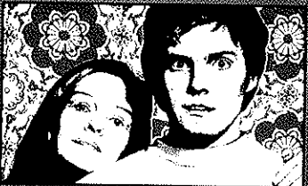
GOODBYE LENIN! a warm-hearted, feel-good comedy