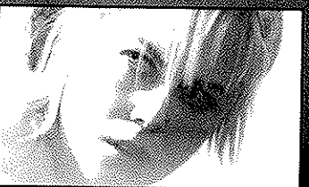
DOGVILLE a brand new film from Lars von Trier